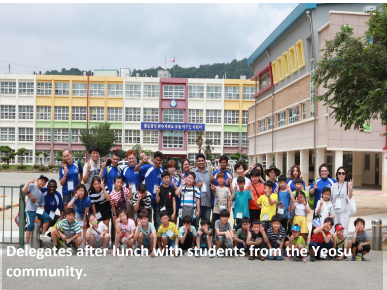
Delegates after lunch with students from the Yeosu community.

The 2018 IYC delegates had many sessions with members of the Yeosu community. For many, these shared moments were the highlight of the week.