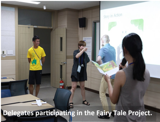
Delegates participating in the Fairy Tale Project.

Delegates discussing their ideas during an IYC session.