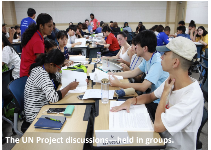
The UN Project discussions held in groups.