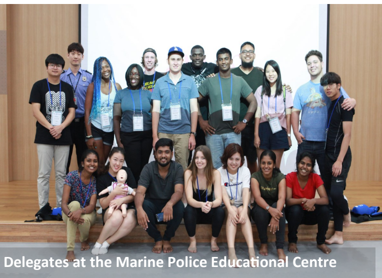
Delegates at the Marine Police Educational Centre